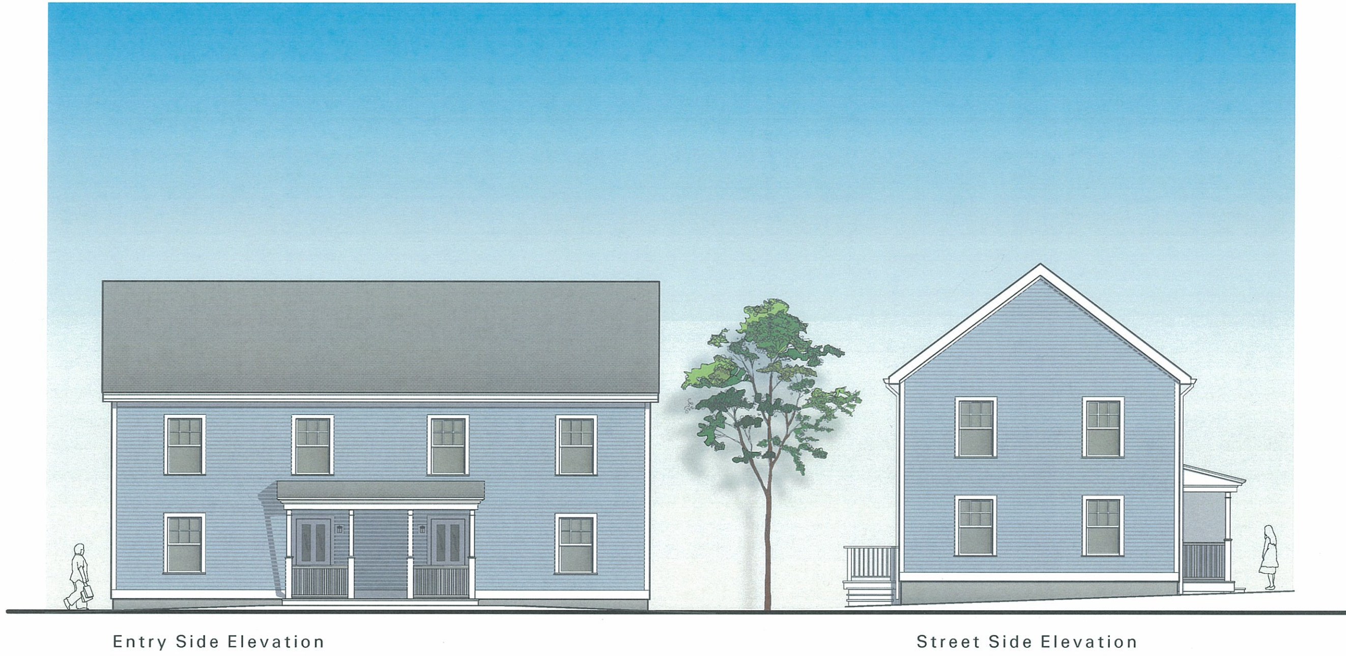
Entry Side Elevation